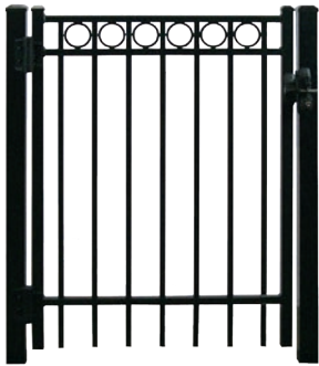
Model 1230R, Satin Black 36" Wide Single Gate