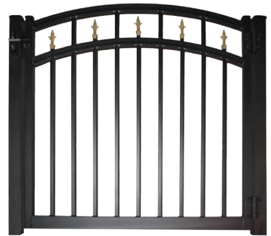
Model 1233, Black Fine Texture with Gold Triad Finials, 48" Wide Single U-Frame Gate with Arch Option