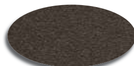
Bronze Fine Texture DSI 107