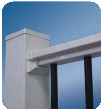
TRX "B" Series White Vinyl with Black Fine Texture Aluminum Spindles