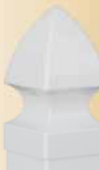
Gothic Cap 4", 5"