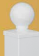
Ball Cap 4", 5"