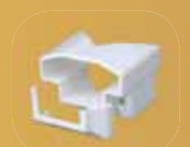
Top 45° Mount (factory pre-cut)