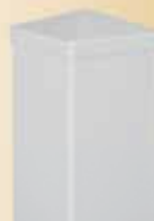
Flat Cap 4", 5", 6"