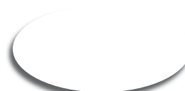
Gloss White DSI 102

Colors shown are a close representation of the true color. Please consult actual samples for accurate powder coating colors.