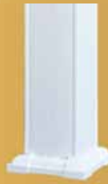
Smooth Column Clad Flair (4-piece)