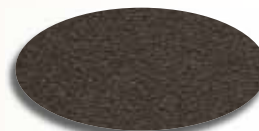
Bronze Fine Texture DSI 107