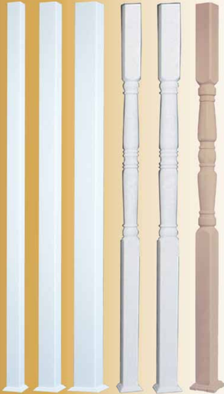
4" 5" 6" 4" "A" Series 5" "A" Series 5" Victorian