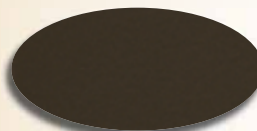
Metallic Bronze DSI 103