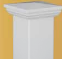
Trim Cap 4", 5"