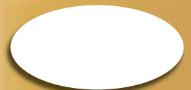
Gloss White DSI 102

Colors shown are a close representation of the true color. Please consult actual samples for accurate powder coating colors.