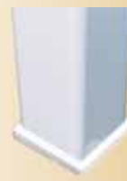
5" Flair (1-piece) Use w/Square Support Posts