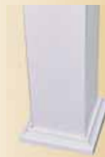
4" Snap Lock Flair (1-piece)