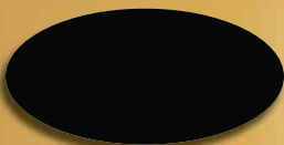
Satin Black DSI 101

Verified AAMA 2604-05 Compliant Powder Coating. Upgrade to optional AAMA 2605-05 powder coating available. Custom colors available.