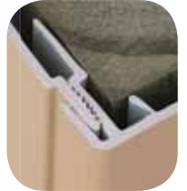
Smooth Column Clad Ratchets to Lock Together