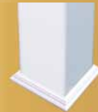
6" Decorative Flair (1-piece)