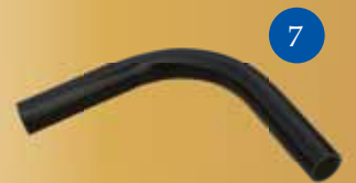
Handrail Elbow 90° Elbow