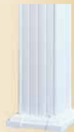
Fluted Column Clad Flair (4-piece)