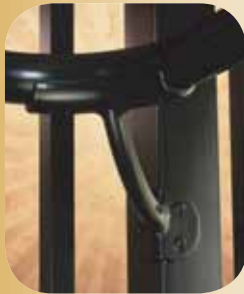
Inside Corner Mount Attaches to Post