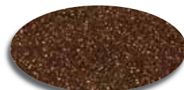
Speckled Walnut DSI 121