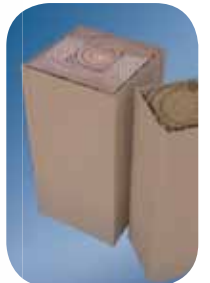
Smooth Column Clad Wraps Over the Wood Post - No Screws Needed