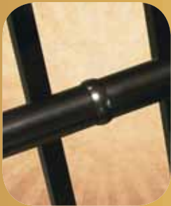
Collar Ring To Cover Splice