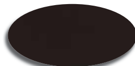
Chocolate DSI 124