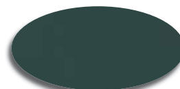
Evergreen DSI 111