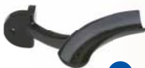
Inside Corner Mount Attaches to Post