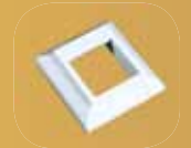
Bottom Rail Mount