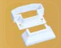
Top Rail Mount