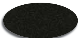
Black Fine Texture DSI 106