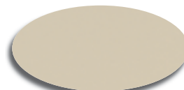
Gloss Beige DSI 104