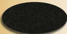
Black Fine Texture DSI 106