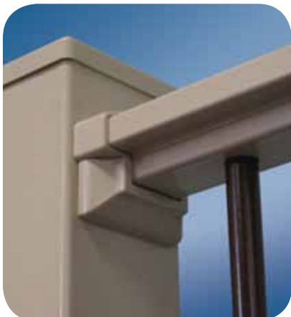
TRX "B" Series Tan Vinyl with Speckled Walnut Aluminum Spindles