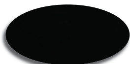
Satin Black DSI 101

Verified AAMA 2604-05 Compliant Powder Coating. Upgrade to optional AAMA 2605-05 powder coating available. Custom Colors Available. These standard aluminum spindle colors are available in all aluminum spindle styles.