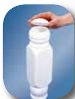
Decorative Post Caps are Easily Attached with Vinyl Adhesive