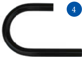
Handrail Return 180° Elbow