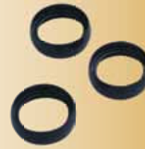
1/8" Collar Rings To Cover Splice