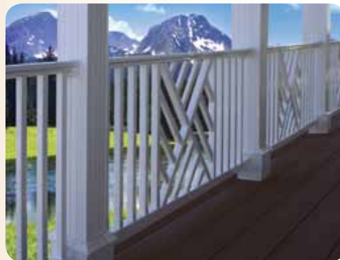
TRX Standard Spindles Double Chippendale White

Compliance: CCRR-0147 (Complies with IBC, IRC, FBC)