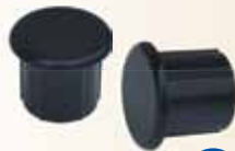
Internal End Cap