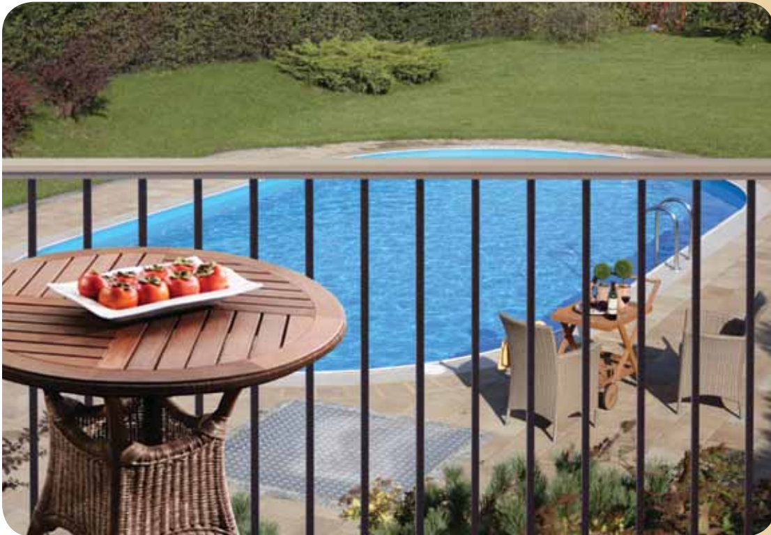
TRX "B" Series Tan Vinyl with Speckled Walnut Aluminum Spindles