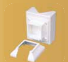
Bottom 45° Mount (factory pre-cut)