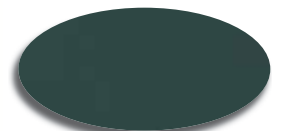
Evergreen DSI 111

Colors shown are a close representation of the true color. Please consult actual samples for accurate powder coating colors.