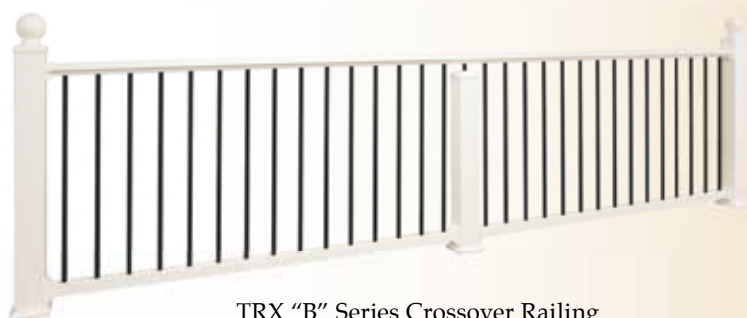
TRX "B" Series Crossover Railing White Vinyl with Satin Black Aluminum Spindles