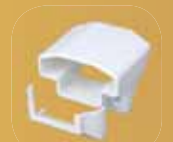
Top Stair Mount (factory pre-cut)