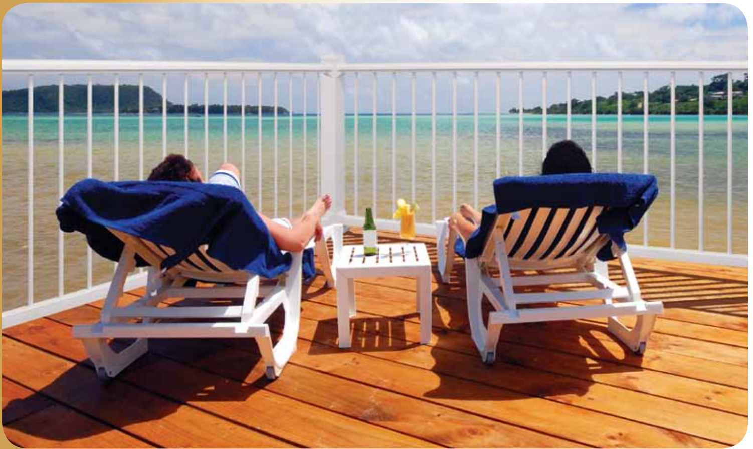
TRX "B" Series White Vinyl with Gloss White Aluminum Spindles