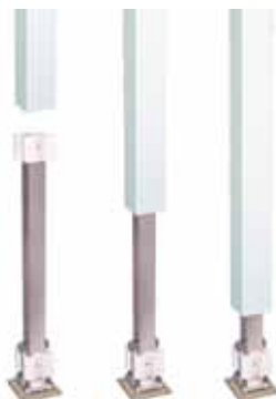
4" Post Sleeve

The Adjustable Aluminum Post Mounts used with Post Sleeves and "A" Series Newel Posts.