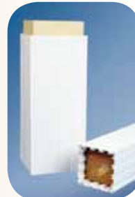
The Beautiful Vinyl Cladding Will Last for Years.