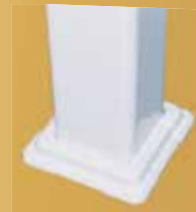
5" Decorative Flair (4-piece) Use w/Decorative Support Posts