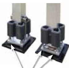
Angle Adjustment Leveling Bolts

Powder coated base plates resist corrosion and ACQ wood treatment.