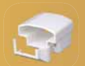
Top Stair/Angle Mount (uncut)