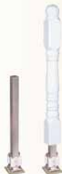
4" "A" Series Newel Post (Available in 38", 44", 48", 52")