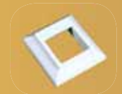
Bottom Stair/Angle Mount