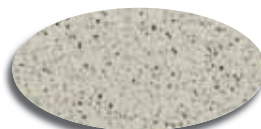
Sandy Shore DSI 122