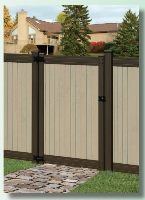
Assembled Matching Gate Frames Can Be Purchased Separately